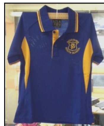
Our new style school polo shirt.