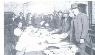
"Never mind, Dad, I'll go instead." The recruiting office, Melbourne Town Hall, during the First World War, 1914-1918.